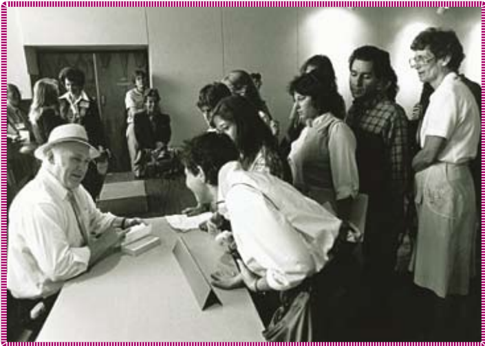
Ken Kesey (the author of One Flew Over the Cuckoo's Nest ) signs his books at Miami Bookfair International in 1984.

Ronald Reagan was president during much of the '80s. Many credit him with helping to end Communism in Europe.